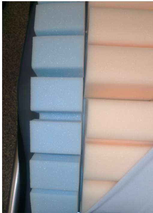
Figure 3. Cuts in the foam open as the mattress contours preventing loss of length.

“It was necessary to carry out a small scale pilot before investing in a large evaluation.”