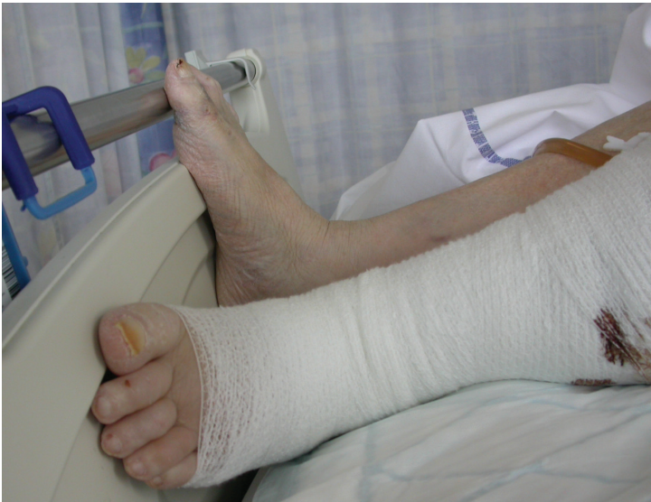
Figure 2. Patient's feet against the end of the bed.

the patient's heel was resting on the mattress. The use of bed frame/mattress extenders is perfectly possible, but rarely used. It is far more common to see pillows or blankets stuffed down the end of the bed frequently resulting in a very high-risk heel resting on a totally inappropriate surface. These practices are incorrect, but understandable. Clinical staff have many demands on their time. They frequently have limited storage space and they simply overlook the correct solution, but do provide a 'quick fix'.